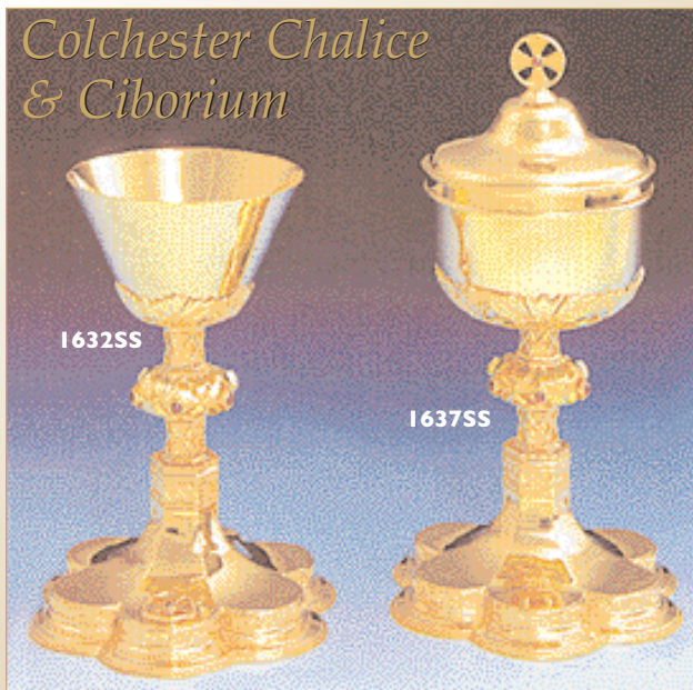
Colchester Chalice & Ciborium